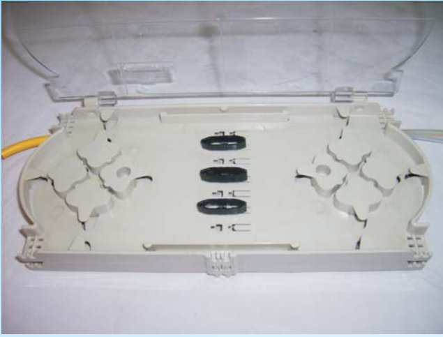
Suitable for Ribbon Fibre