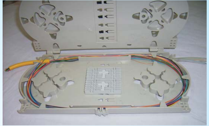
Suitable for up to 48F